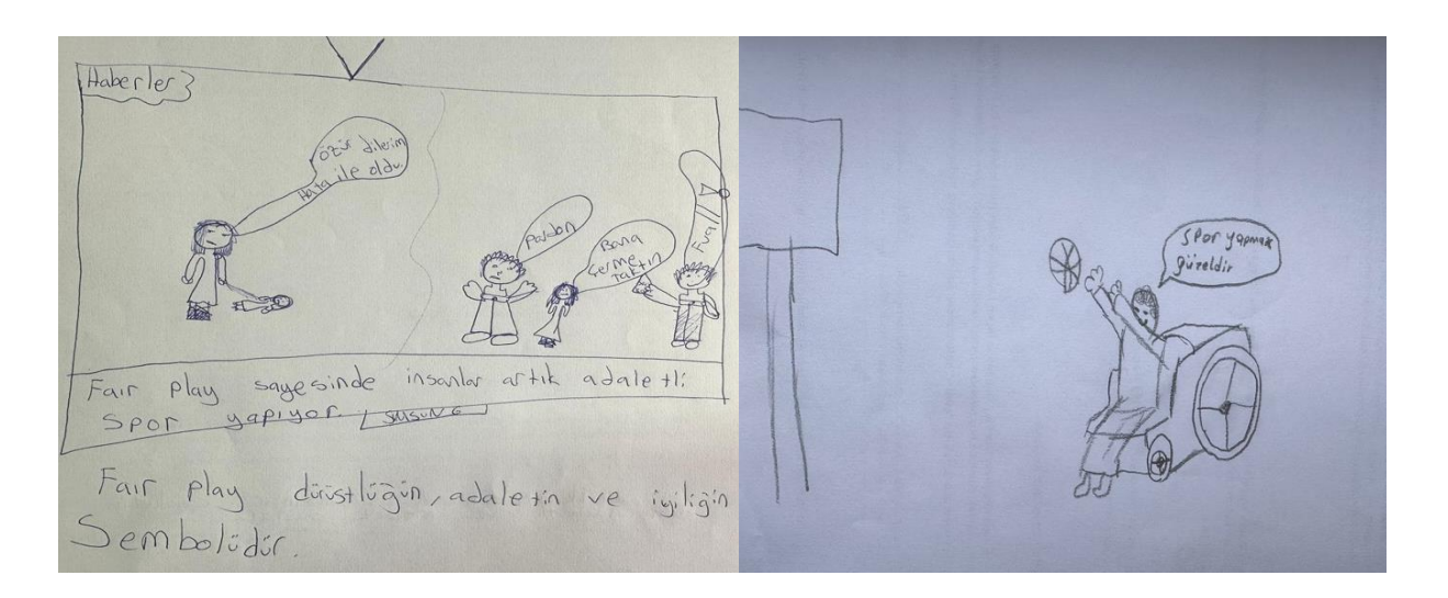
Figure 3(a-b). Drawings for Fair Play as an Element of Justice

"Fair play is like/similar to the right to play sports, because; It is the right of a person who does or cannot do sports to do sports." (Student 17)